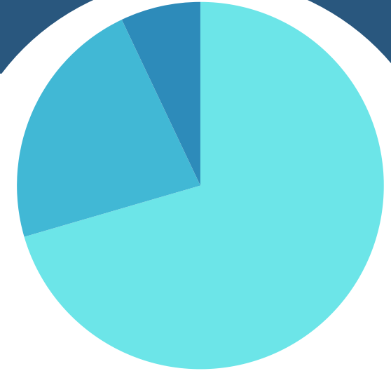
Measure B Actual Expenditures & Allocations