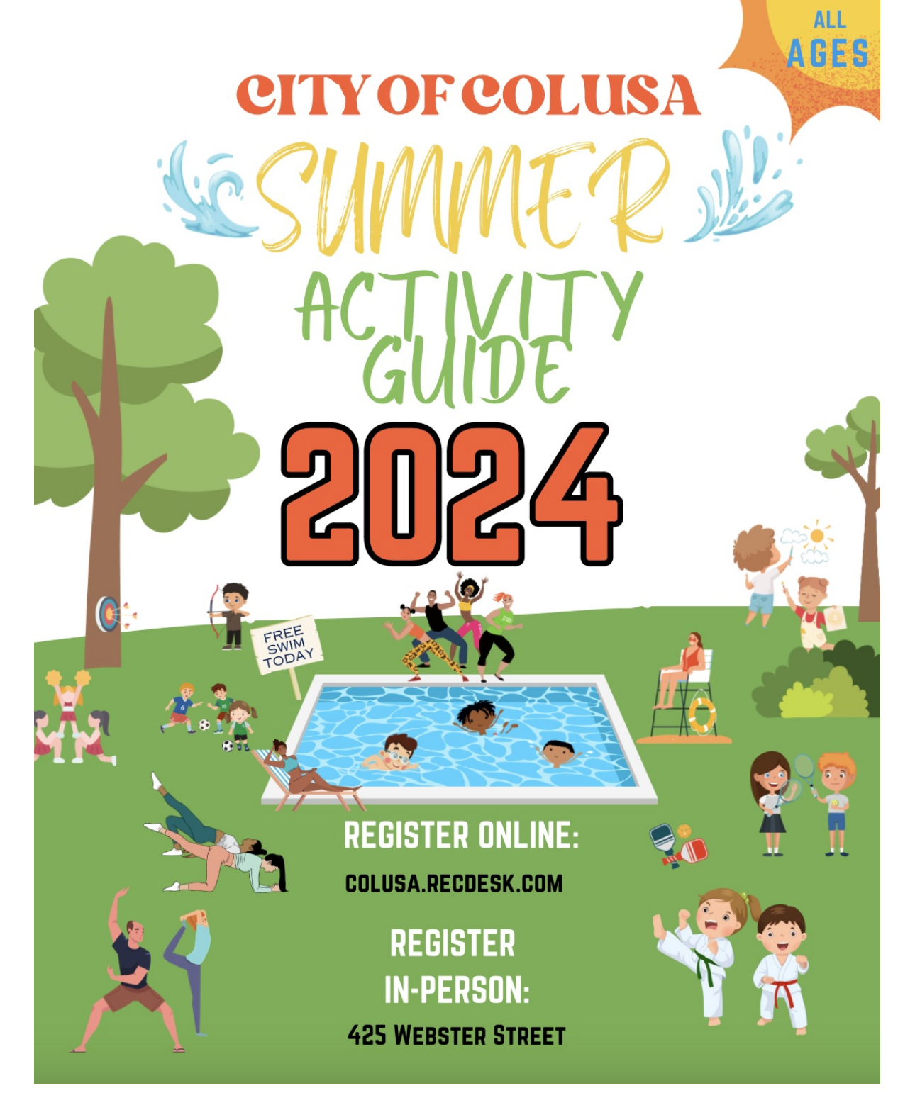
The 2024 Recreation Guide is here!!! Check out this years guide at the link below, or by visiting www.colusa.recdesk.com.