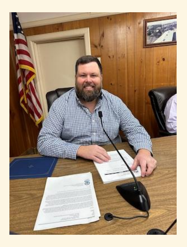
2025 MAYOR RYAN CODORNIZ

Additionally, the City Council hosted a workshop focused on updating the city's purchasing policy, ensuring transparency and alignment with current operational practices. These efforts highlight Colusa's dedication to efficient governance, strategic planning, and community-driven progress as it moves forward into 2025.